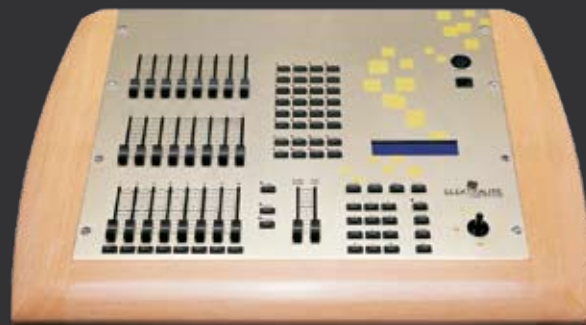
model n° C P 20 x t